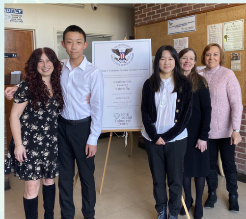
The President's Volunteer Service Award