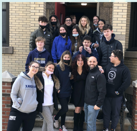
Xavarian HS Day of Service