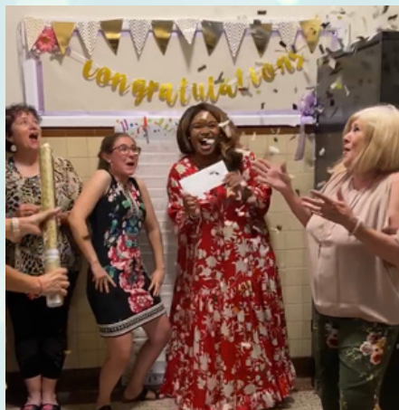
Kathleen Mullally Foundation Scholarship award